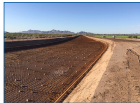
CONCRETE CHANNEL LINING