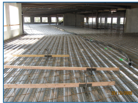
SLAB ON METAL DECK